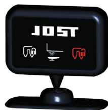
5th wheel senses contact with skid plate