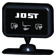
5th wheel open/ready for coupling