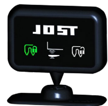
5th wheel coupled correctly & closed