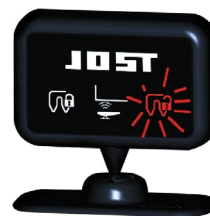
5th wheel not coupled correctly- start again